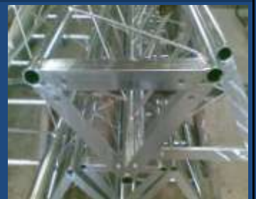
Stacked tower sections