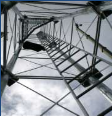
Looking up inside tower