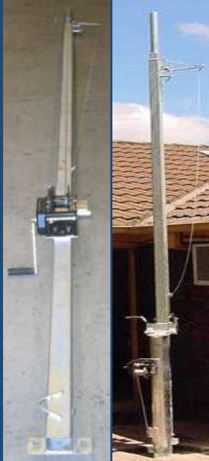
Pipe Mast Free Standing