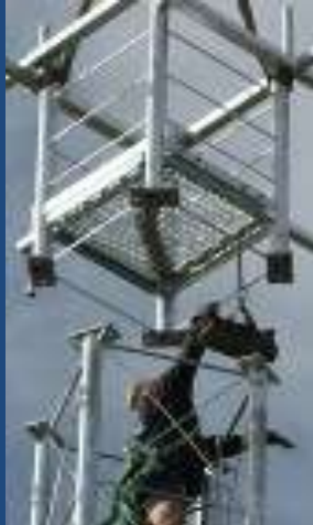
Positioning Top Section