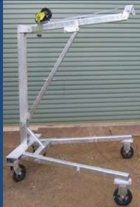
Small Crane Basic Model