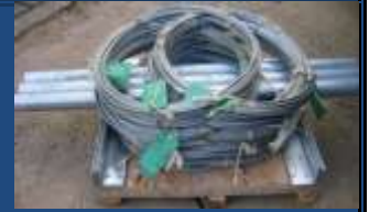
Guy Kit and Out Rigger Kit