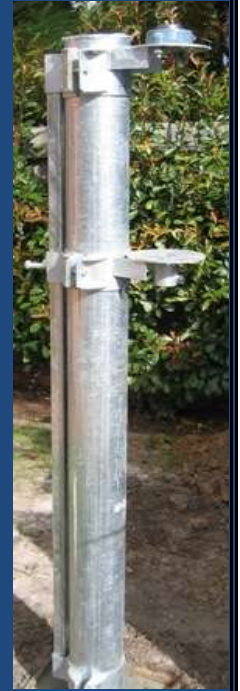
Rotatable Dish Mount

Ground and Roof Top Mounts specials designed to customer requirements