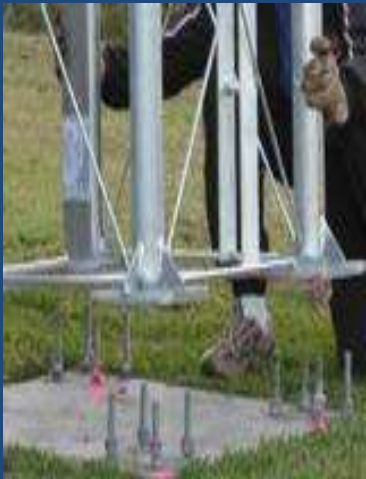
Positioning bottom section