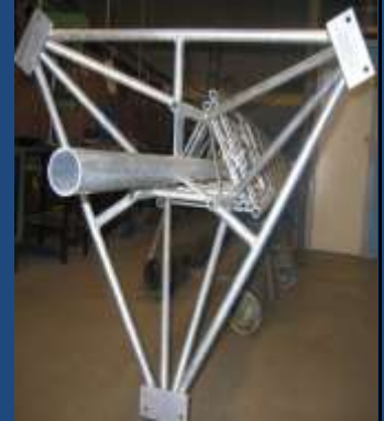
Anti Twist Frame