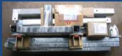
Small Crane Flat Packed

Basic Lightning Arresters with light mounting