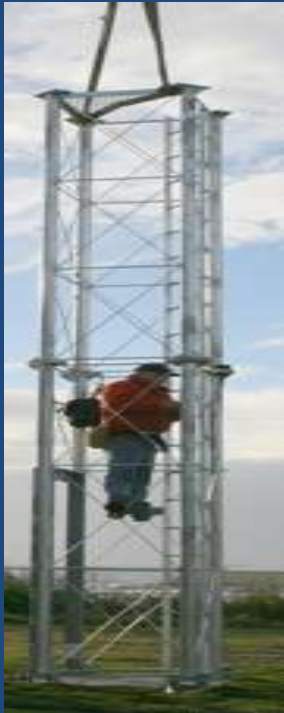
Joining bottom 2 section